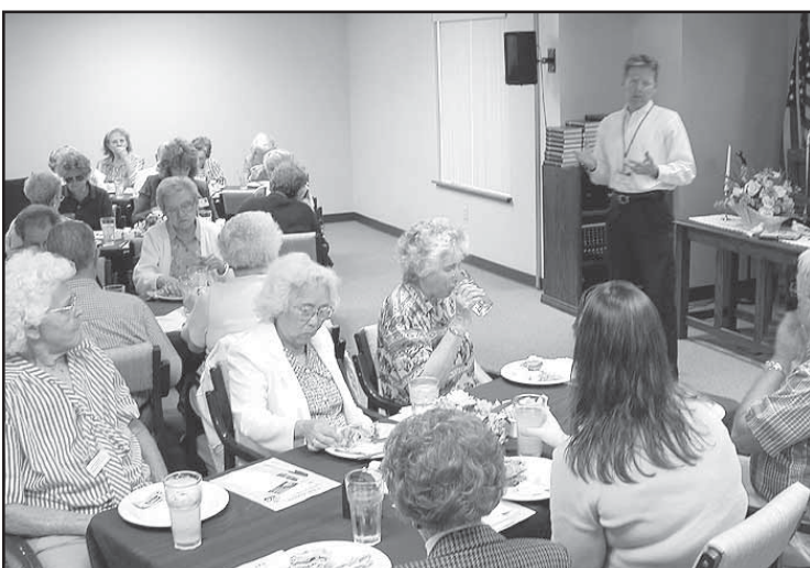
The Baptist Home - Ozark provided food and an informational program for members of the seniors group from St. John's Hospital. The Home has also hosted several local church groups.

Ordinary people... and quite extraordinary too!